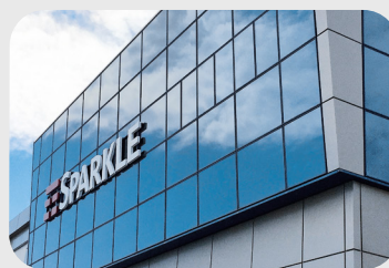
KOROPI Built Space: 2,580 m 2 Power: 2 MW