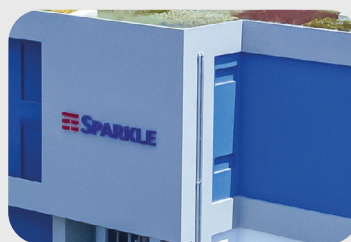
METAMORFOSIS II Built Space: 5,831 m 2 Power: 7.7 MW