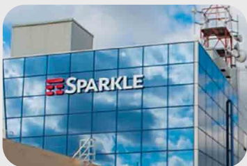
METAMORFOSIS I Built Space: 4,000 m 2 Power: 3.2 MW