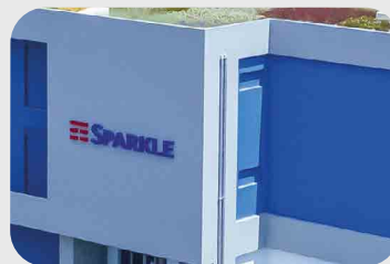
METAMORFOSIS II Built Space: 5,831 m 2 Power: 7.7 MW