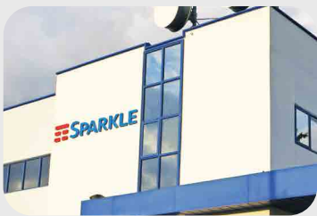
CHANIA Built Space: 1,579 m 2 Power: 0.8 MW

Sparkle Greece has been certified with ISO-9001:2015, ISO/IEC-27001:2013 and ISO 20000-1:2018 from Lloyd's, meaning it operates to the highest standards in planning and selling colocation services, disaster recovery services and capacity. It has also been certified for ISO 14001 and PCI-DSS.