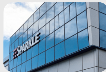
KOROPI Built Space: 2,580 m 2 Power: 2 MW